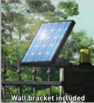
Wall bracket included

A 10W solar panel (dimensions 14"H x 11.4"W x 1.2"D) provided with brackets for mounting onto a wall (included) or post (optional). Additional solar panel can be added for improved charging capabilities.