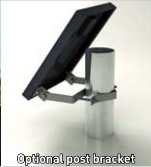
Optional post bracket

\alpha > 10^\circ \alpha = angle/latitude